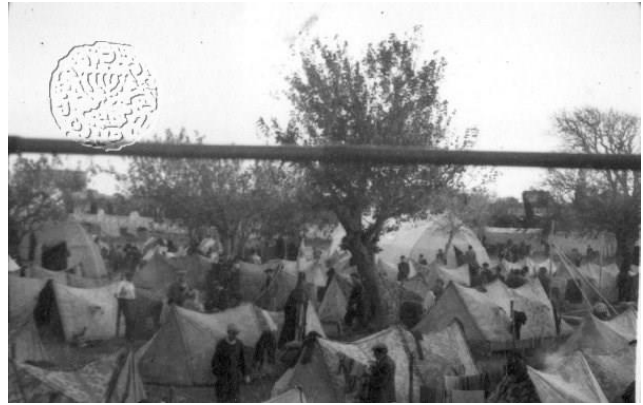
Campo San-Giovanni, tent camp set up on island of Rhodes for illegal immigrants of the Pencho

When the CRR learned about the wreckage of the Pentcho, it alerted Greeks in Herakleion who then endeavored to have supplies delivered to the stranded refugees on Kamilonissi. On October 18 and 19, Italian authorities picked up the refugees on two sorties and brought them to the main island of Rhodes where they stayed for the next year and a quarter in a hastily constructed camp in the soccer stadium of Rhodes. On December 25 th they moved them to San Giovanni Camp in Rhodes.