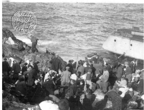
Illegal immigrants from the Pencho on island of Camilla Nisi watch as the ship sinks

A few days later, on October 9, the ship's boiler exploded, and the ship broke in two off of the deserted island of Kamilonissi in Dodecanese territory, then under Italian control. The passengers and crew were able to get ashore and off-load their supplies before the ship finally sank. Five men took the ship's only lifeboat to look for rescue. Though they were caught in a storm and lost their bearings, they were eventually rescued by a British destroyer and taken to Alexandria.